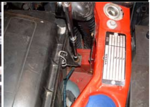
3. Remove the screw as picture show. Pull the air filter box upwards to loosen. Turn hoses and wiring aside to remove the air filter box.