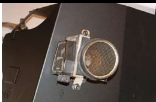
8. Attach MAS to the heat shield using the supplied screws, nuts and washers.