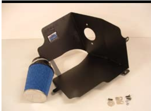
1. Material overview.