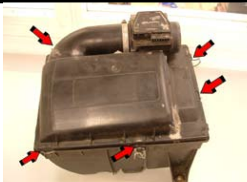
5. Open the air filter box.