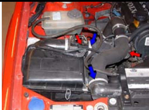
2. Disconnect the electrical plugs (red arrow). Disassemble the inlet hoses from MAS (mass air sensor) and intercooler (blue arrow).