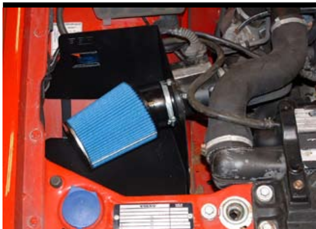
10. Mount the inlet hoses to MAS and intercooler. Connect the electrical plugs to MAS and air valve. Attach BSR airfilter and tighten the hose clamp.