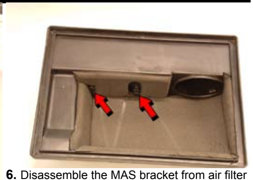
6. Disassemble the MAS bracket from air filter box.