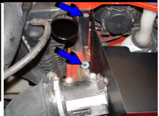
9. Mount the heat shield and secure as picture show.