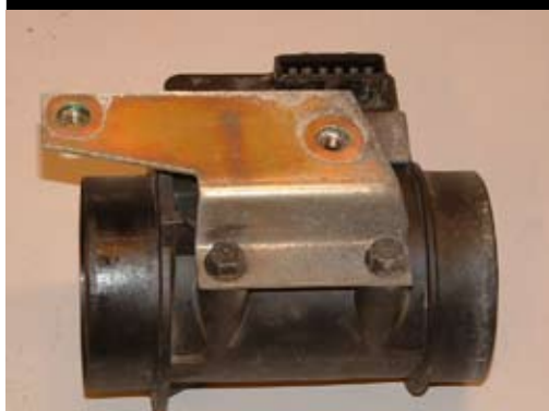
7. Remove bracket from MAS.