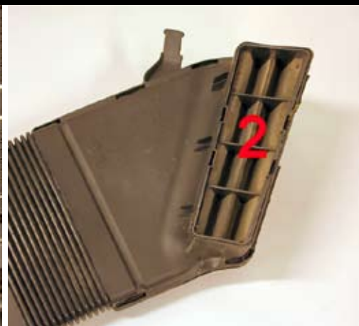
3. Remove the filter from the inlet pipe. (2).