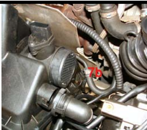
5. Remove the lower hose clamp (7b) for the EVAP-pipe and loosen the hose.