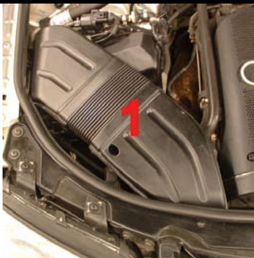
2. Remove the inlet pipe. (1).