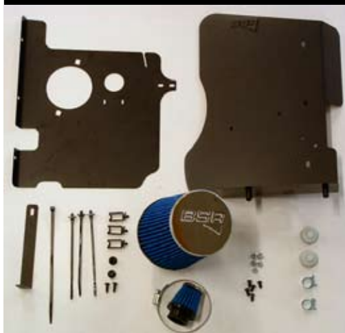
1. Material overview.