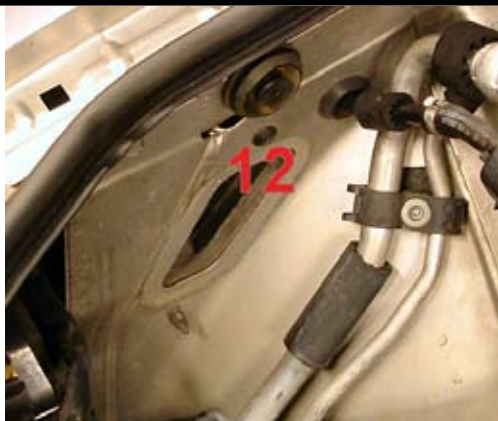
8. Remove the screw (12).

Attach the air mass meter and the EVAP-pipe to the heat shields. Assemble the EVAP-pipe to shield (A) with the 3 tie wraps, attach points (9). Assemble the clips (10) and the rod (11).