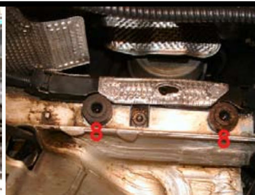
6. Use the original rubber bushings (8) when mounting the shield.

First remove the air box from the upper attachment at the inner side fender. Then easily pull it up until it releases from the rubber bushings. Remove the harness and pipes at the same time for an easy liftup.