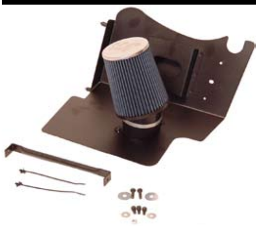
1. Material overview.