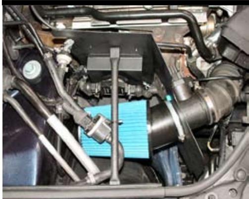
7. Fit the BSR air filter and the intake hose to the MAS. Mount the evap-pipe using plastic ties and hose clip (supplied).