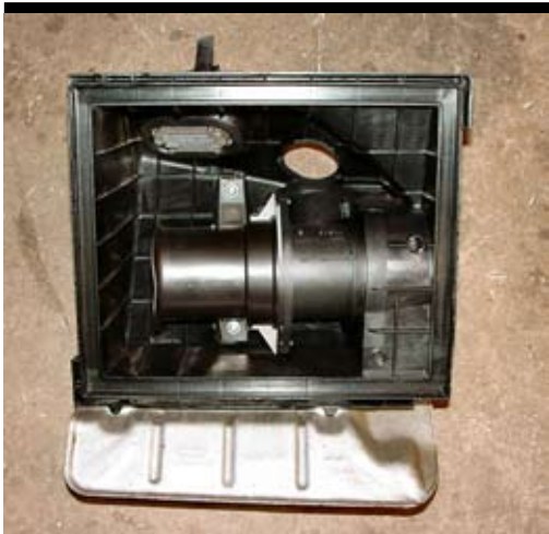
4. Open the air filter box and remove the MAS (mass air sensor). Don't use the seal and the plastic intake.