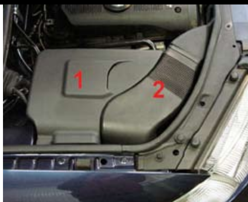
2. Remove the protective housing (1) and the inlet pipe (2).