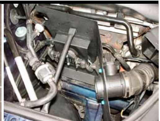
6. Fit the heat shield into the original rubber bushings. Use the supplied bracket for mounting the heat shield. Lead the electrical harness through the "angled amplifier-holder" and connect the electrical plugs to the evap-valve, MAS, amplifier and air-valve.