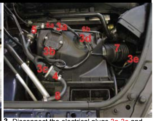
3. Disconnect the electrical plugs 3a-3e and put the electrical harness aside. Remove the evap-valve (4) from the air box. Remove the hose clamp (5) and open the binding clip 6a-6b holding the evap-pipe. Put aside. Unclip and remove the intake hose (7) from the air box. Remove the screw (8) holding the air box. Pull up and remove air box from vehicle.