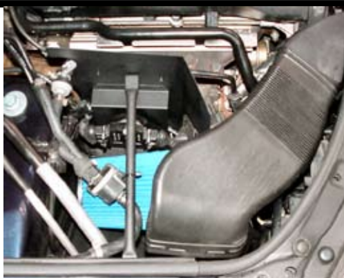
8. Mount the inlet pipe. Don't use the protective housing. Enjoy!