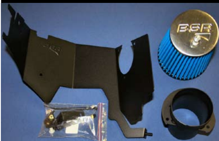
1. Material overview: