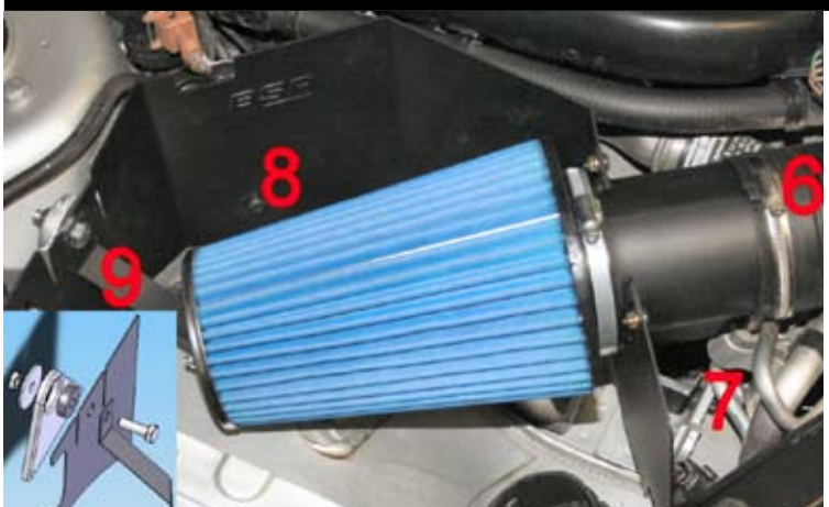
5. Mount the heat shield: Start with connecting the intake hose (6) to the pipe and the steering pin in the rubber lead-through (7). Mount the rod (8) with M6. (Do not tighten fully yet). Mount the rod (9) to the air filter before it connects to the intake pipe and the chassis upper hold. Tighten all the loose screws (3), (8), (9). Enjoy.