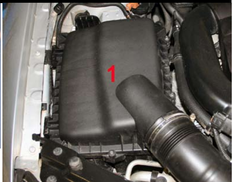
2. Remove the air filter box (1). Start with the lid. Loosen the torx screws and the hose clamp. Lift up the bottompart. (The original rubber lead-throughs is not to be used)