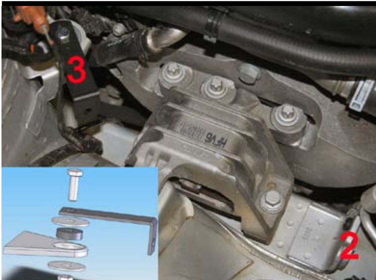
3. Mount the rubber lead-through (2) and the rod (3) with M8 screw/nut (do not tighten fully yet). Mount the washers as the picture shows.